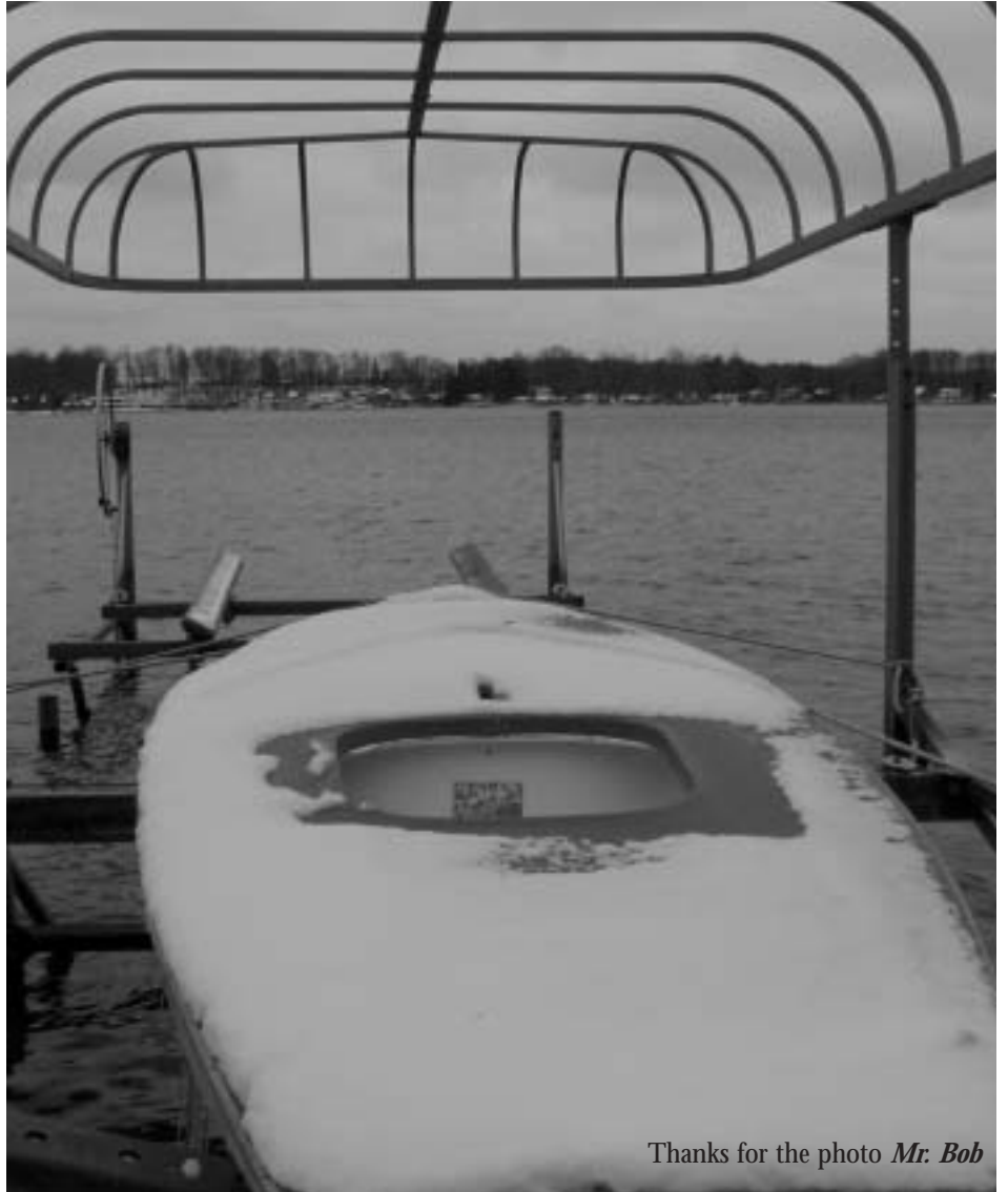
Thanks for the photo Mr. Bob

permitting, with a 1 o'clock push time. Watch for the marks, if they're out we plan to start, but we'll also call around to spread the word. Most of you are adults and know when you should or should not sail. However, in some situations we will not hold a yacht club sponsored race, but marks will be out for all of you thrill seekers. Such a situation would be if there is a storm/severe weather watch, and/or the committee boat cannot hold anchor (absolutely not on 20mph days). On light wind days, 30 minutes to the first mark or the day is called off.