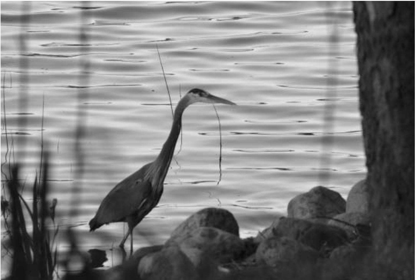
Now there's a fisherman! Thanks to Sarah Petty (North side) for the great photo of the Great Blue Heron.

© Copyright 2012, The Birch Lake Yacht Club