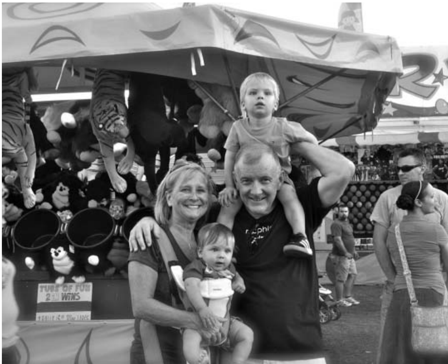
Mimi, Papa and their precious cargo