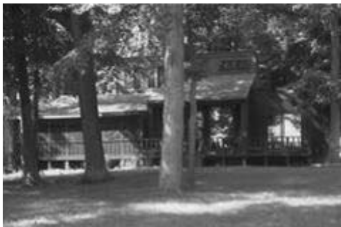
14739 Kiloqua Woods — $560,400