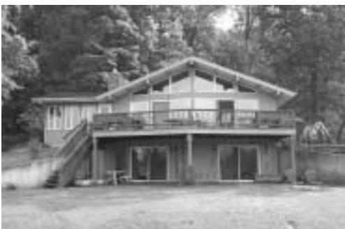
14719 Kiloqua Woods — $695,000

Two spectacular Birch Lake North Shore Homes